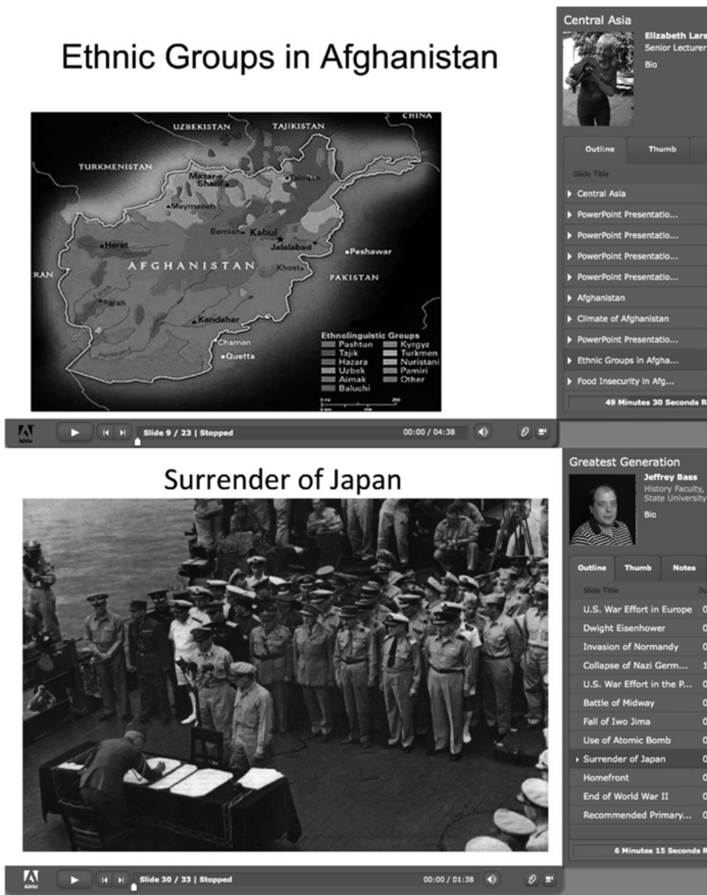
Fig. 8.3 Screenshots of Adobe Presenter lectures from geography and history for the WORLD class

development team as a model was immigration and the U.S. Mexico border. History assignments involve primary source readings on the history of the borderlands. Geography assignments task students to map of borderlands utilizing online programs to make a mental map, analyze the region of the U.S./Mexico borderlands, make a population geography map of the borderlands using U.S. Census data, comment on videos of labor issues along the border, chronicle