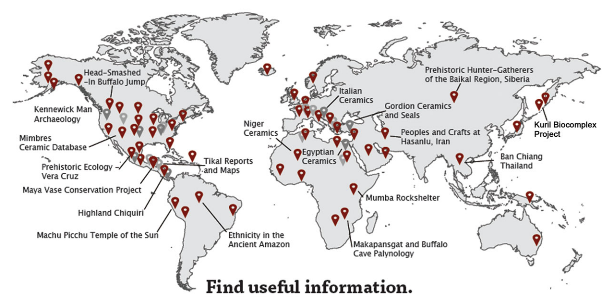
FIGURE 3. Schematic view of global contents of tDAR showing some examples.

worked with the Maryland Archaeological Conservation Laboratory and Fort Lee Regional Repository to establish an archive in tDAR for digital files from 17 military facilities for which these two repositories curate physical collections and associated paper records (Cofield and Eyre 2014; Department of Defense Legacy Program 2014).