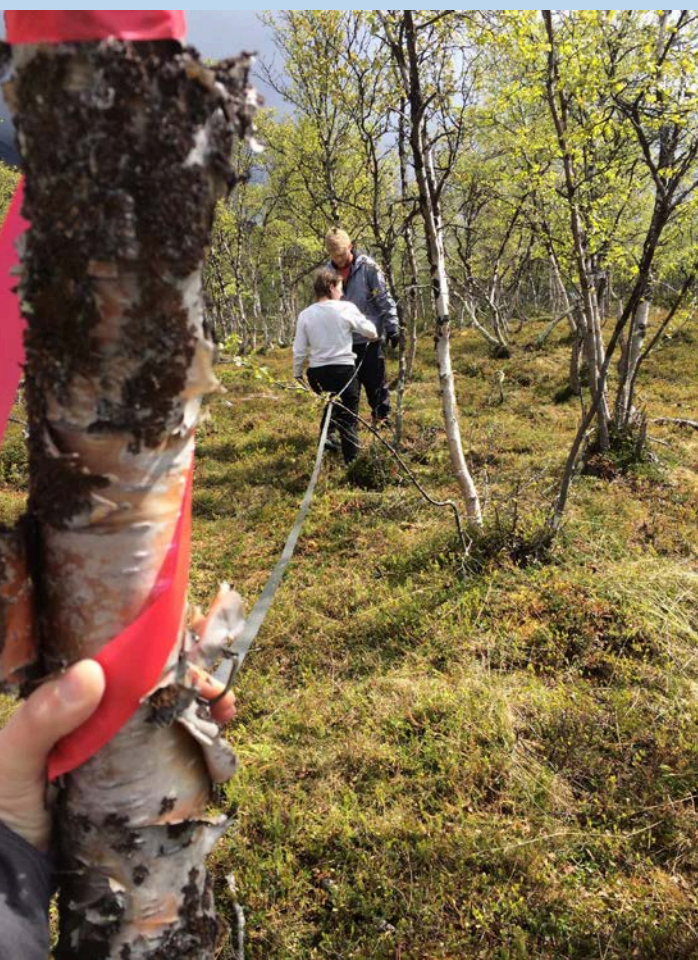
Figure 4. Brooke and Andrew measuring the survey area