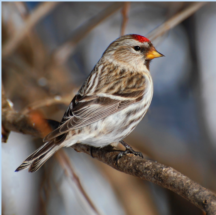
Figure 7. Redpoll