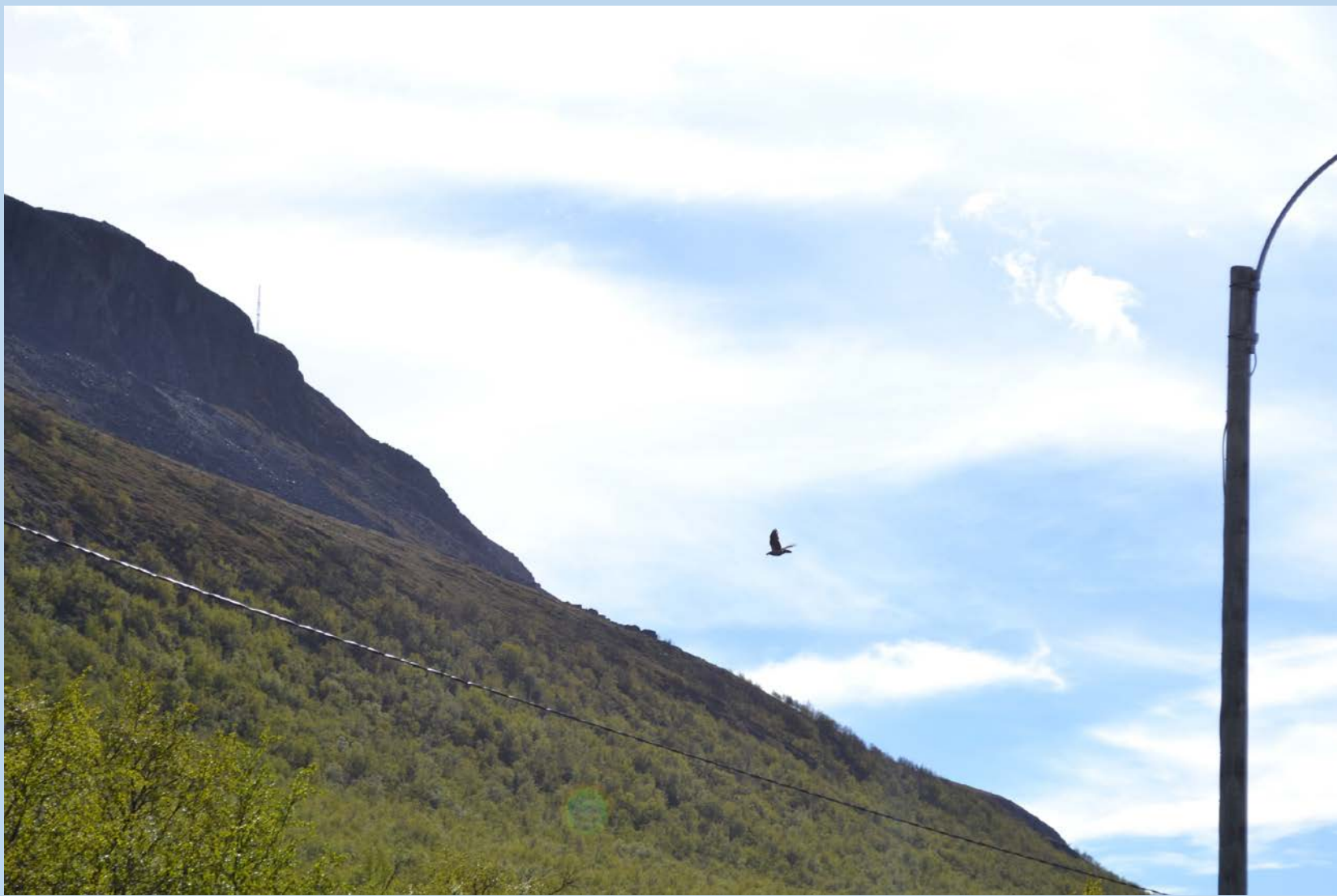
Figure 9. Crow with food in beak flying over the survey area. The transmission line and light post seen are along the E-8.