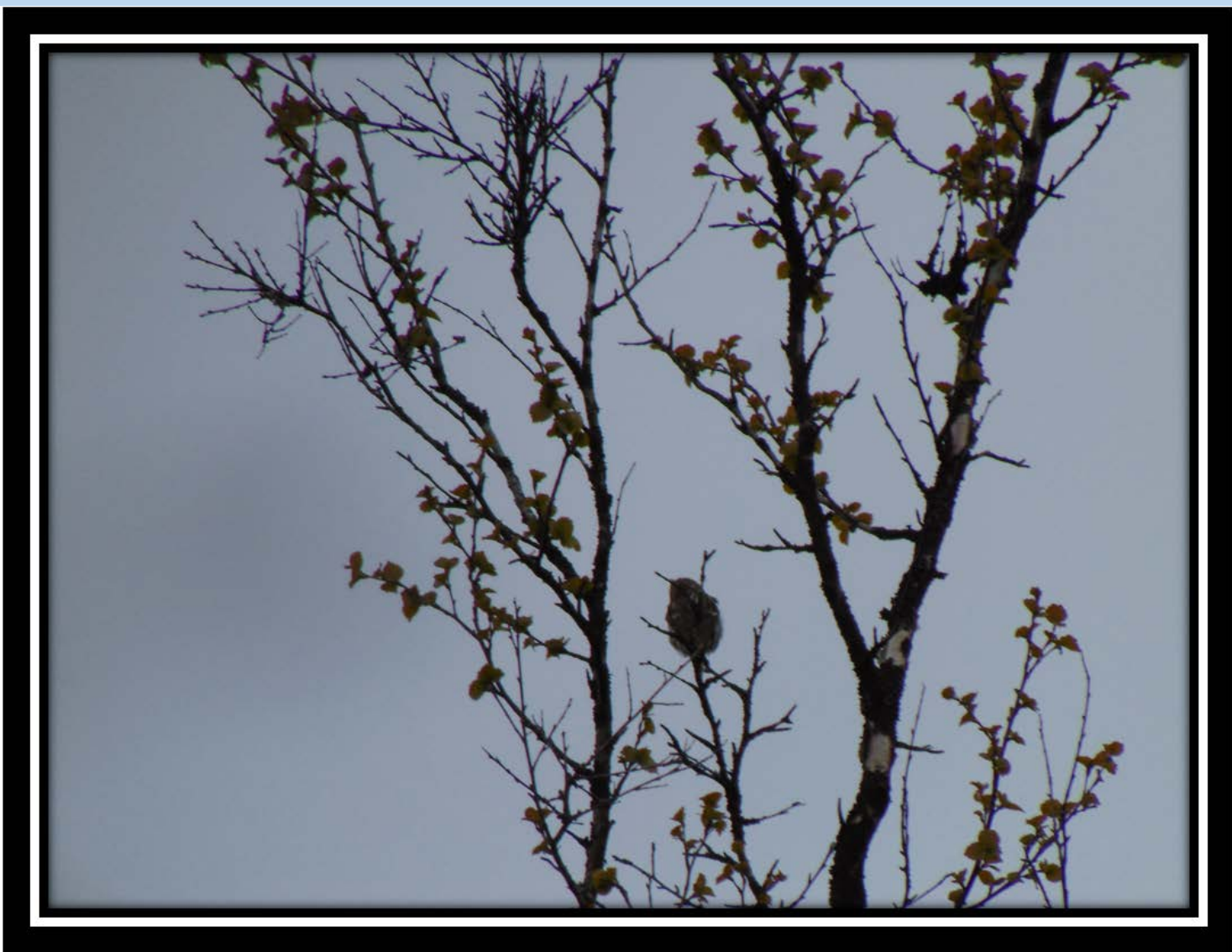
Figure 2. Unidentified bird in a silver birch tree