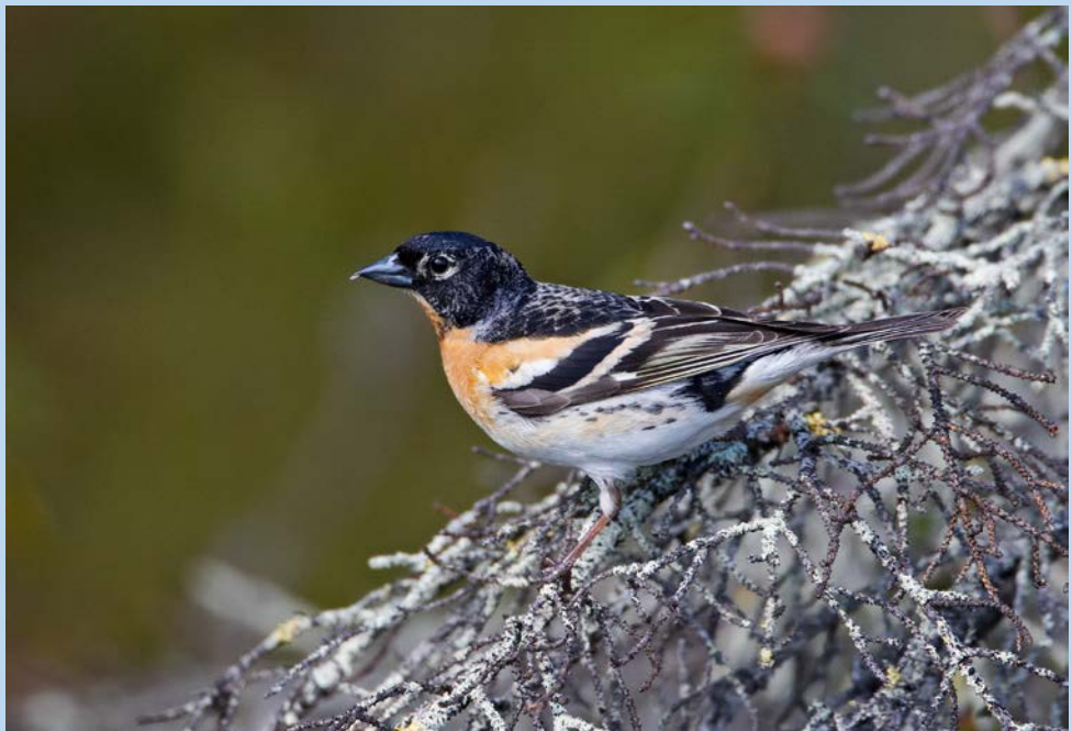
Figure 8. Brambling