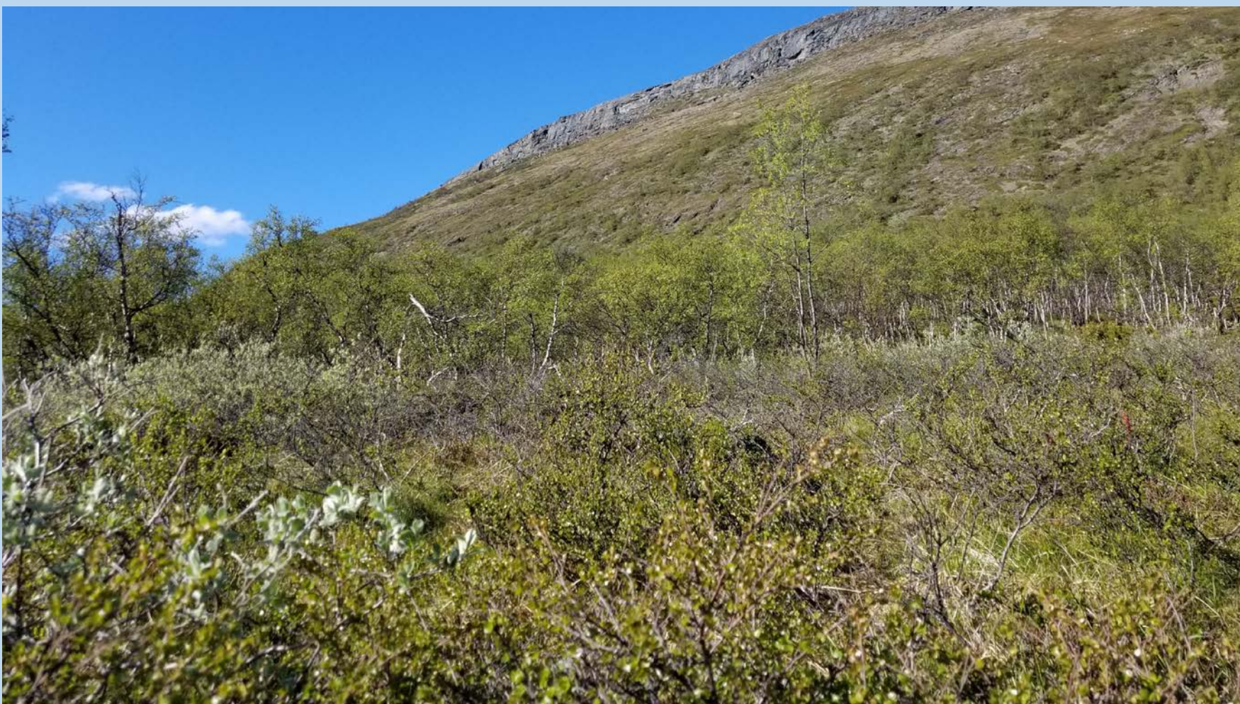
Figure 1. Survey area; view from the E-8

We hypothesize that as the distance from the road increases, so will bird diversity and abundance.