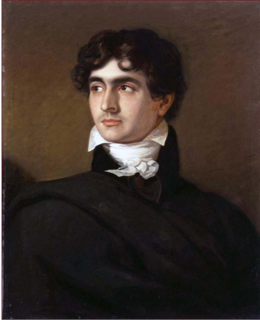
John William Polidori 7 September 1795 – 24 August 1821