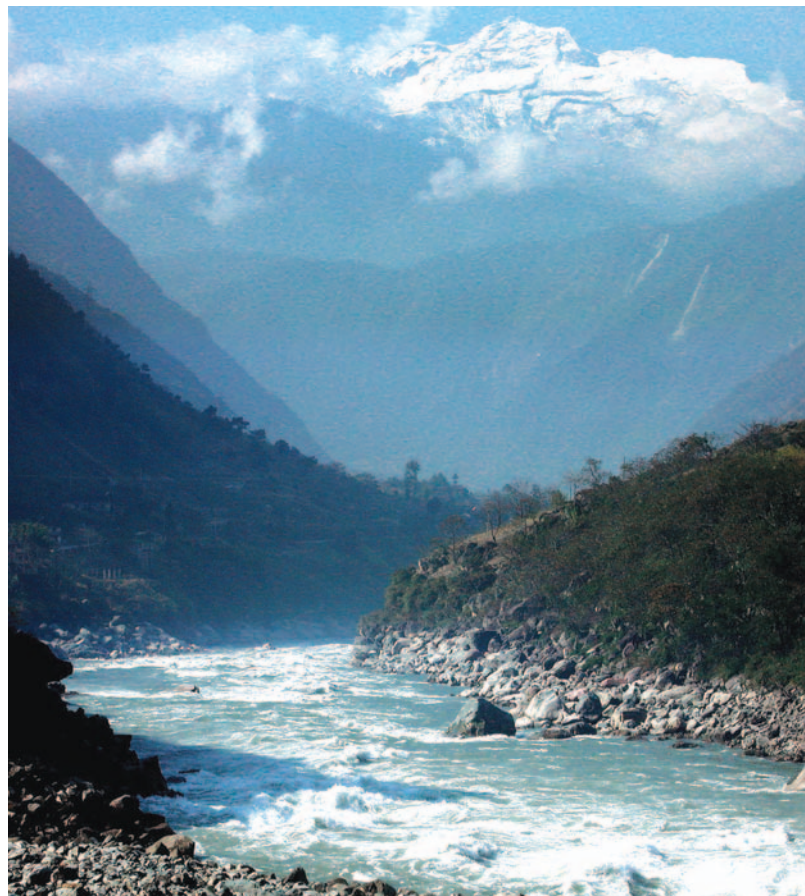
Figure 1 Rugged topography of the Sichuan region of China. View towards the southwest showing rapids through a landslide deposit in the Dadu river gorge and snow capped mountains of the Gonga Massif in the distance. Here, the Dadu River is at ~1,100 m in elevation. Mountain peaks to the west rise to elevations of over 7,000 m within a distance of less than 30 km, making this region one of the most dramatic examples of topographic relief on earth.

This observation is at odds with the impression of active tectonic upheaval created by the rugged topography (Fig. 1). Indeed, previous studies in the region dating back to 2000 and 2003 that focused on geomorphic analysis 6,7 inferred that faults in the region must be active, and identified regions of high rock uplift rate 8 . The 2008 earthquake struck along one of the fault systems that had been suggested to accommodate high rates of rock uplift. The topographic analyses