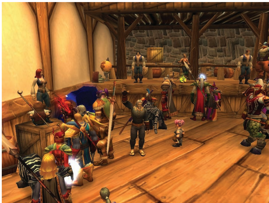
Fig. 1. The Stormwind Auction House in WoW. The three figures wearing vests and standing on platforms are the computer-generated auctioneers, whereas the dozen other figures are characters belonging to real human beings participating in auctions involving a thousand or more people. The one waving in the center is the avatar of a scientist who is studying this virtual world and the computer-assisted systems it provides to facilitate social interaction and economic exchange.

During this time of transition, when there is active speculation about the investment opportunities, it is exceedingly difficult to estimate the current economic impact of virtual worlds, let alone project the future. For example, a Web site called Wowhead that was merely about WoW recently sold for 1 million dollars, and the game’s $15 monthly charge across many subscribers could generate hundreds of millions of dollars per year (10). Virtual worlds differ as to whether their internal currency can be exchanged for dollars (SL, yes; WoW, no), so economists face the scientific dilemma of how to count wealth generation inside the games, in addition to the external dollar investments and returns. Exploratory studies by Nick Yee suggest that most players are in fact adults, disproportionately male but with a wide variety of occupations and demographic characteristics (11), so virtual worlds are not simply a childish fad. However