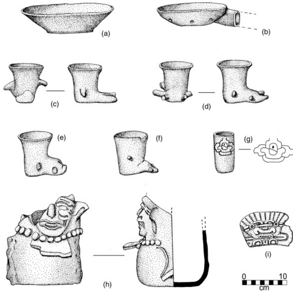
Figure 2. Zapotec ceramic objects from Calixtlahuaca. (a) G35 conical bowl; (b) handled censer; (c–f) bat-claw vessels; (g) cylindrical vessel with glyph; (h) urn or effigy vessel; (i) headdress fragment. See Table 1 for catalog numbers and information about the pieces. The glyph was drawn by Jennifer Wharton; the vessels were drawn by Jessie Pellerin based on photographs taken by Smith and Wharton.

large ceramic sculpture of Xipe Totec—was also recovered in Mazapan phase deposits at Teotihuacan (as discussed later).