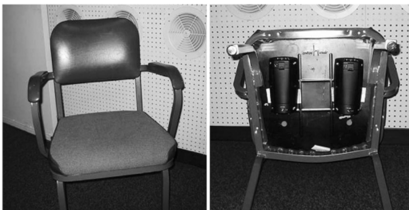
Fig. 1. The subliminal-signal chair as it appeared to participants (left panel) and the hidden apparatus under the chair (right panel).

momentary improvements should evoke the obvious attribution that prior experience is responsible.