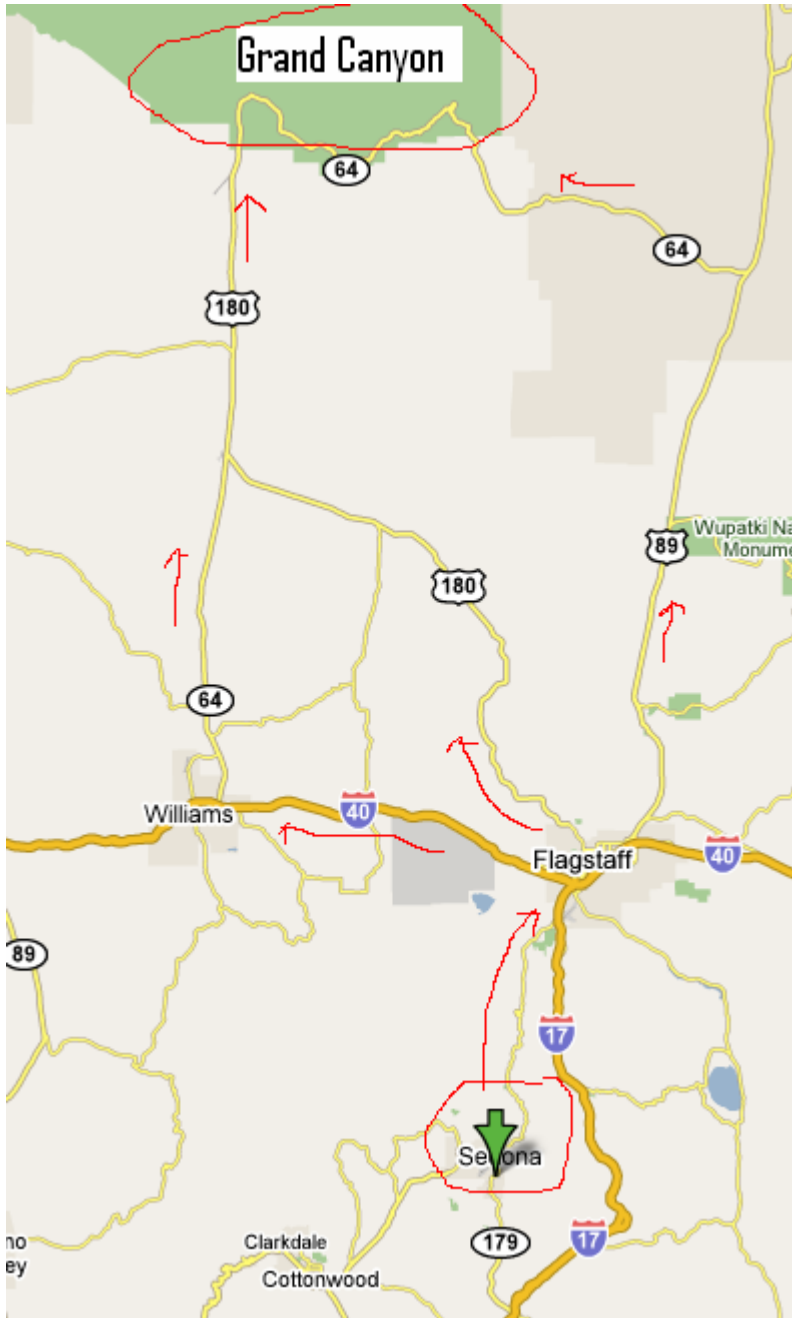
Map 1: Possible Routes between Sedona and Grand Canyon