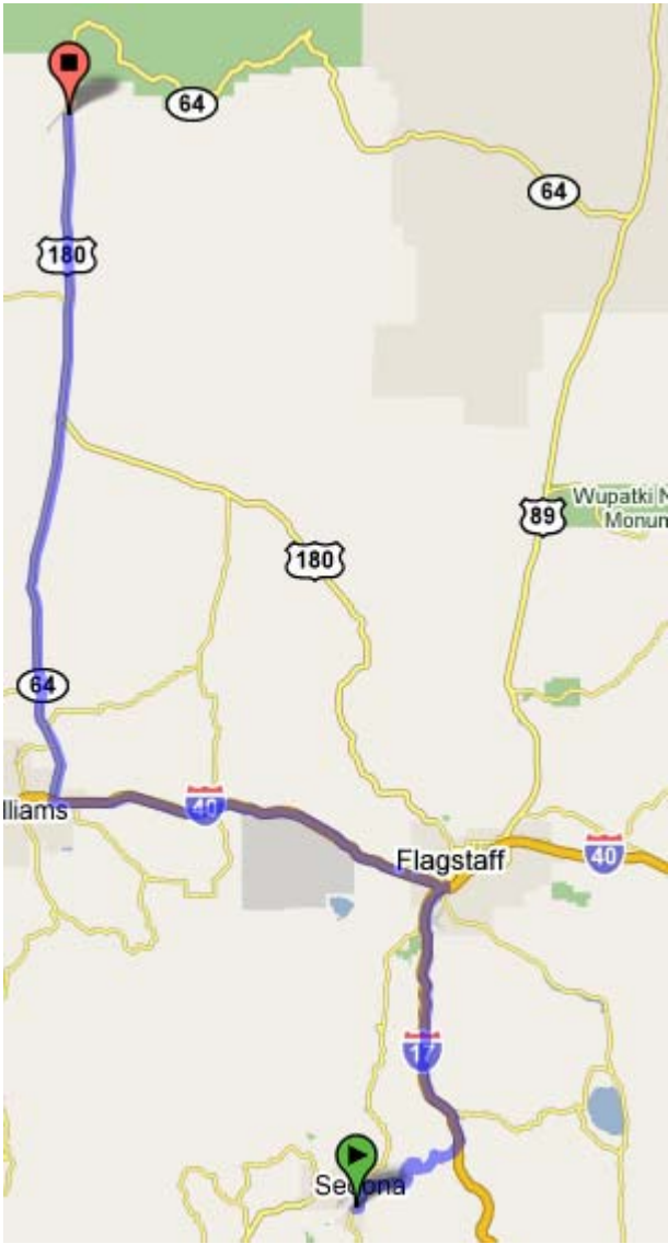
Map 2 Alternative Route