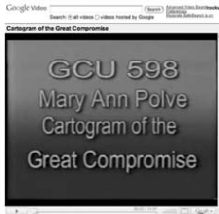
Figure 3.—The program uses different modes of delivery of material, including (a), streaming of videotaped presentations, (b), voiced over PowerPoint presentations, and (c), the media site mixed format.