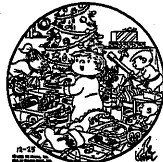
"Wow! I must've been gooder than I thought!"

THE FAMILY CIRCUS. Reprinted with special permission of King Features Syndicate.