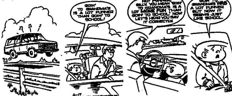
THE FAMILY CIRCUS Bil Keane, Inc. Dist. By Cowles Synd., Inc.