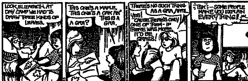
FOR BETTER OR WORSE reprinted by permission of United Features Syndicate, Inc.

Optimal Age, Universal Grammar (i.e. innatism), Interlanguage, Interference.