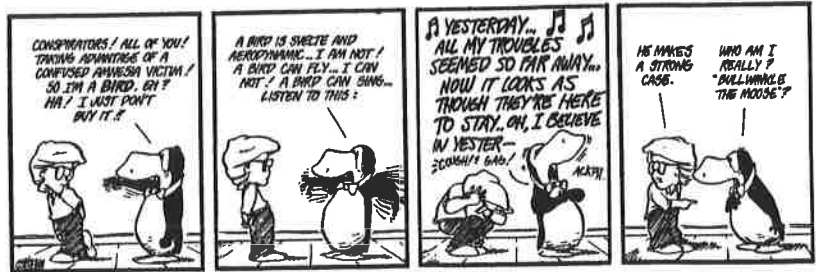
BLOOM COUNTY by Berkeley Breathed. Reprinted with the artist's permission.