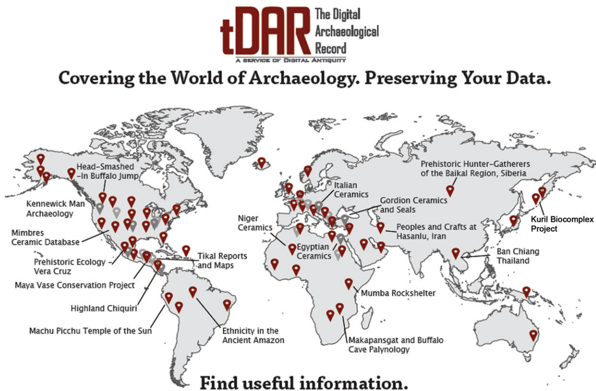
FIGURE 3. Schematic view of global contents of tDAR showing some examples.

worked with the Maryland Archaeological Conservation Laboratory and Fort Lee Regional Repository to establish an archive in tDAR for digital files from 17 military facilities for which these two repositories curate physical collections and associated paper records (Cofield and Eyre 2014; Department of Defense Legacy Program 2014).